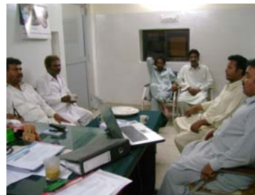
Members of the Committee during their daily meeting.

We are grateful to God that the IDPs have accepted CVTC as their home, living as a joint family and managing daily affairs with the Diocesan staff.