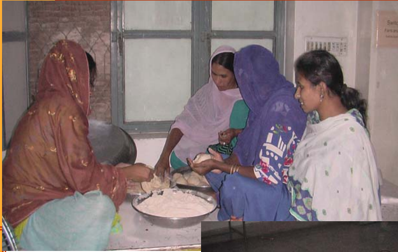
Left: The IDP Women at the Diocesan Camp Mardan assisting in preparing food for all the residing families.