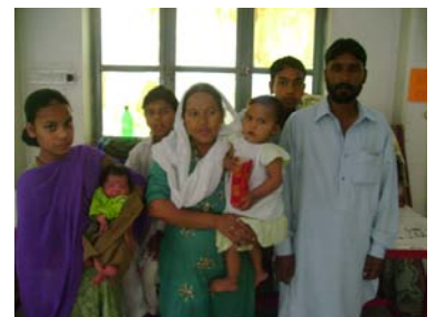
An IDP Family at the Relief Camp