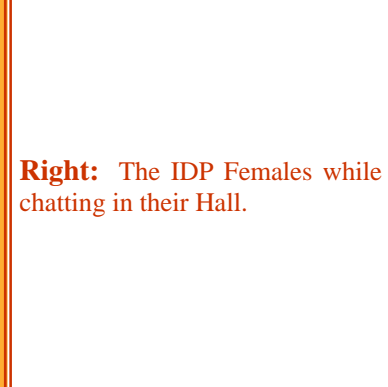
Right: The IDP Females while chatting in their Hall.