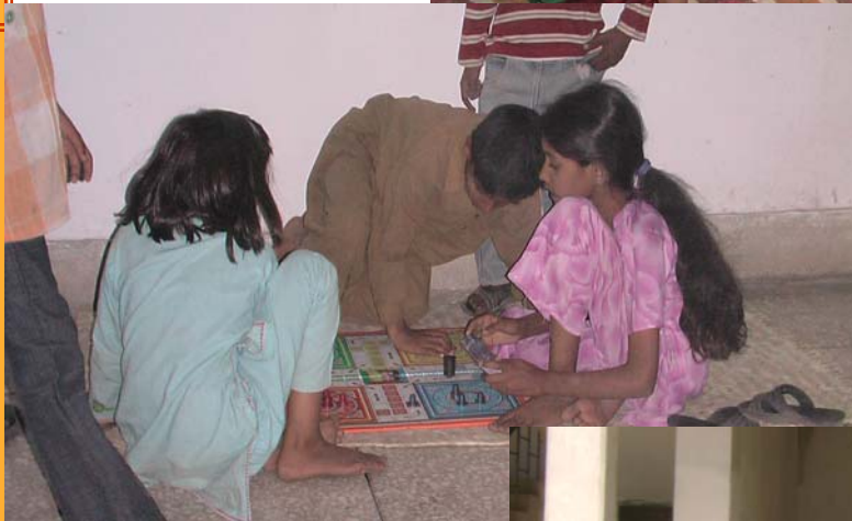
Left: The IDP Children playing at the Diocesan Relief Camp, Mardan.