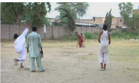
Glimpses of the match

biting finish, Swat Youth managed to grab the victory and the gold medal. Malakand Youth tried their level best to create some situation to draw the match, but the luck was not on their side.