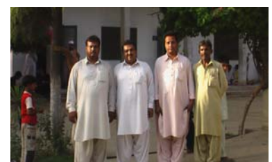
Field Staff with local Volunteers

Diocesan Field Staff is assisted by the local Diocesan Volunteers, while the Senior Development staff supervise and monitor the overall progress of the Camp activities.