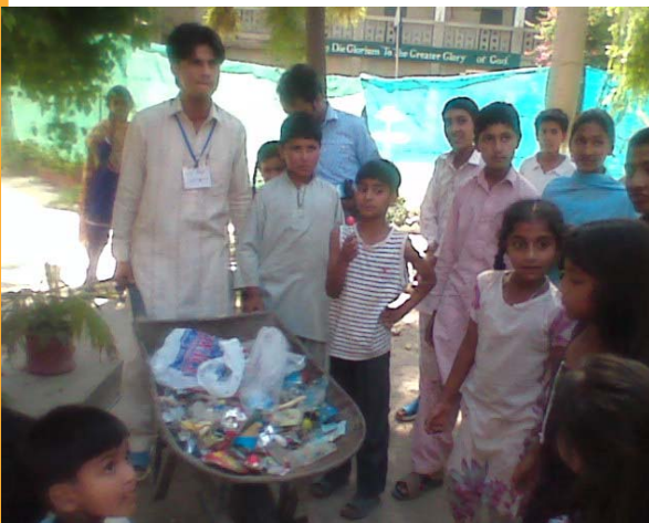
Below: IDP Children cleaning the Diocesan Relief Camp at CVTC Mardan.

Books, Notebooks and stationary for the boys and girls to read and write.