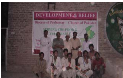
Malakand team, the runner ups.

The Elders from both the sides awarded medals to the participating youth and appreciated the Diocesan effort.