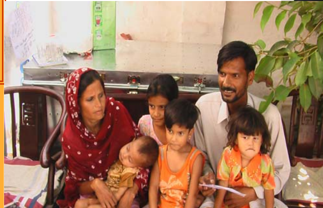
Left: An IDP family staying with their relatives in Peshawar.