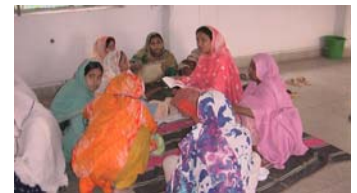
IDP Girls and Boys reading Bible and sharing their thoughts.

The Diocesan Relief Camp has One hundred and Nine (109) girls and One hundred and twenty-nine (129) boys. Bible classes are arranged on daily basis. During the two hour Bible study they discuss and share their experiences.