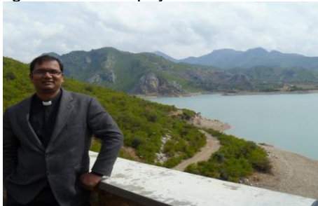
A Trainee Priest enjoying the view at Campus

Initially, this place was built for Edwards College School pupils, for their recreational and educational activities in a natural environment. But, another reason or objective to build this retreat centre was to use it for the Clergy of the Diocese for their in-service trainings and retreats. Before the establishment of this Retreat Centre, Peshawar Diocese used to utilize the Murree Retreat & Renewal Centre of the Lahore Diocese, and other facilities of different Christian organizations on payment.