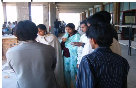
Youth, during Discussion Time in Campus

The School's administration and the Diocese together bought a piece of land in Harripur district, near Khanpur Dam, a beautiful scenic place; and an up-to-the-mark 'Retreat Centre' was erected in 2005. It has dormitory, conference hall, toilets and room for accommodating upto 150 persons at-a-time.