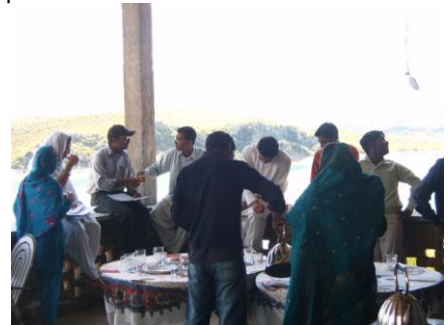
Tea Time at the Jubilee Campus

So far, this facility has not been utilized for commercial purposes, like the Murree Retreat & Renewal Centre, or like the NCCP's facility in Khanspur, Ayubia. But, this place certainly has potential.