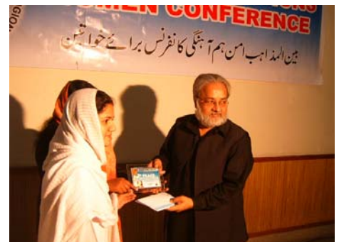
Shia Leader Presenting Shield to a Speaker