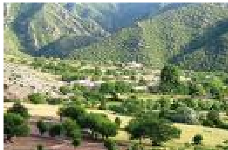
A Scenic View of Parachinar