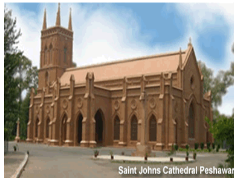
Saint Johns Cathedral Peshawar

“Make every effort to keep the unity of the Spirit through the bond of peace.” (Ephesians 4:3)