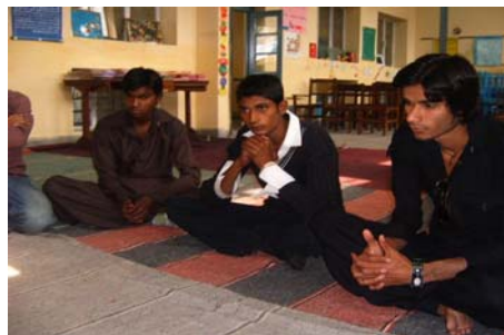
Youth Meeting in Nowshera Parish

New projects and programmes were also discussed with youth and women groups, and they were encouraged to work more effectively for the community development.