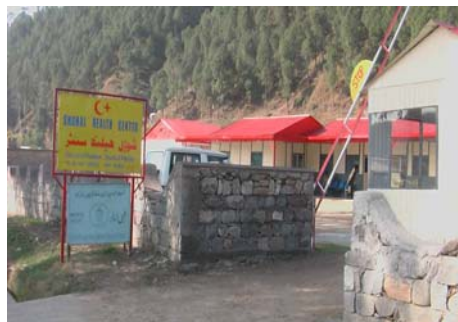
Shawal Health Clinic, Balakot

Shawal Health Clinic for the earthquake victims of 2005, is running smoothly and serving the people of the surrounding villages of Balakot.