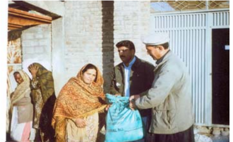
Food Items Distribution in Parachinar

provide them with relief packages a number of times, but that's simply not enough. The Shia community does get relief packages from Iran, and sometimes they also support the Christian community, but that's not enough either.