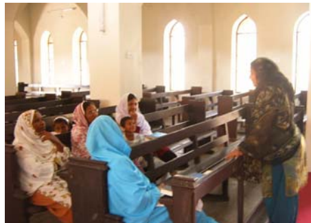
Women Meeting in Risalpur Parish