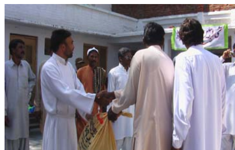
Food Items Distribution in Swat

Swat and Malakand have been badly hit by the militants, and later due to the war against them. Basic infrastructure has been affected as well, so still there is very little prospect of people lives coming to normal, as far as their financial situation is concerned.