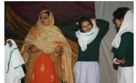
Veil ceremony in progress

A veil ceremony for midwifery school students was held at Pennell Hospital, Bannu. There are 20 students, and 7 of them passed their first year exams and have entered into their final year of training. This was a record number of students in Midi-school’s history.