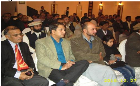
Participants of the Programme

Besides different denominations, i.e. Church of Pakistan, Roman Catholic, Anglican Orthodox, Pentecostal & Brothern Mission, guests from Muslim, Hindu and Sikh communities also participated in the programme.