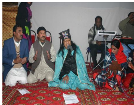
Christian Musical group from Jacobabad