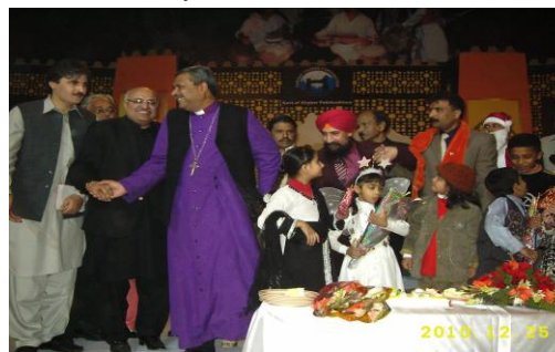
Bishop Humphrey with the Minister of Information

The famous singers and actors performed their popular numbers and skits, and the atmosphere was electric. People highly appreciated their performances and on every performance applauded wholeheartedly.