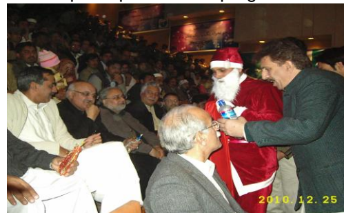
Santa Clause distributing the gifts