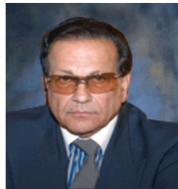
Late, Governor Salman Taseer

The untimely death and brutal murder of Salman Taseer, Governor of Punjab has been widely condemned by the people of Pakistan.