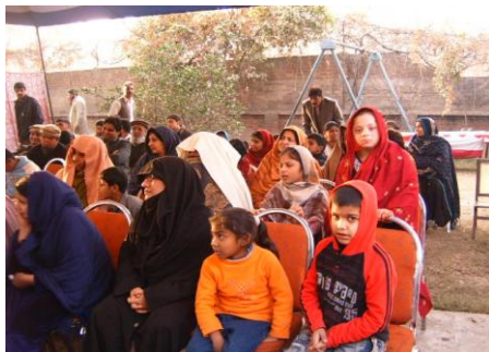
Parents & children during the Training Course

Pupils studying in special schools spend only a few hours out of their homes, during this time the child and his parents both get a break, but MHC believes in empowering the parents and communities by transferring knowledge, skills and attitudes, thus developmental work continues at home.