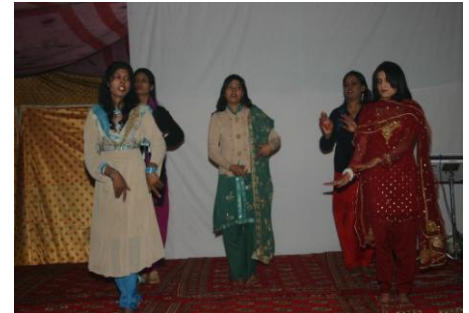
Midwifery staff performing at the show

and administration for the treatment, and welfare of the communities living in and around Bannu, and the Waziristan agency. He said the hospital services are a true witness, and present the Diocesan Mission statement in letter and spirit.