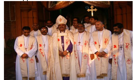
The Bishop, the Arch-deacon and the Clergy