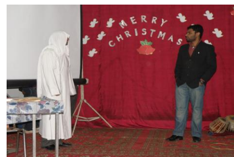
Christmas drama presented by youth