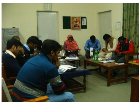
The Youth in Prayer Session

Youth Executive Members of the 3 rd Diocesan Youth Council organized a Prayer & Orientation Program on Saturday, 4 December 2010, at the Diocesan Centre, Peshawar. The new Executive Members decided to kneel before God, before starting their ministerial work among the youth.