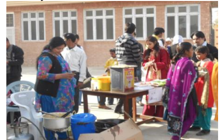
Ladies at the fun fare programme

On 11 December 2010, Annual Sports day for the PMCH staff was arranged by the administration of the hospital, the idea was to encourage the staff and people to indulge in healthy activities.