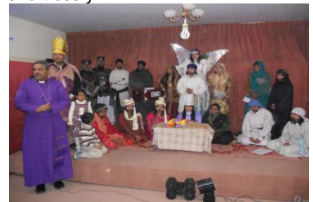
Bishop addressing the gathering

A Christmas Drama was played at PMCH, the title of this long play was, “Sitara Chamakta Raha” . The talented staff and students of the hospital played different roles effortlessly.