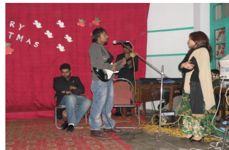
A youth member performing at the function