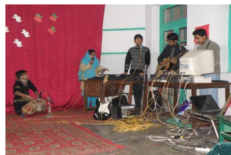
Christmas Carols performance