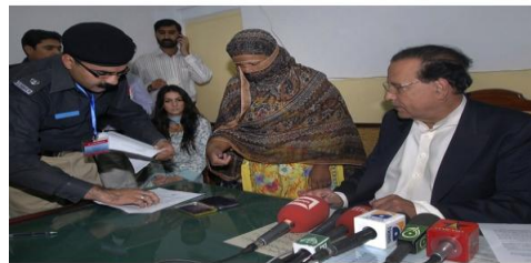
Salman Taseer with Aasia Bibi at Police Station

The minorities in Pakistan, especially Christians were deeply saddened by his death at the hands of the extremists, as he was considered as champion of the rights of minorities. He always stood by the minorities, despite a number of threats to his life, and treated the minorities as equal citizens of Pakistan.