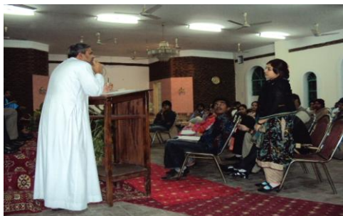
Youth Council Meeting in progress

Three members of the Youth Council have been given representation in the main Diocesan Council, and the President of the youth council also represents the youth in the Diocesan Executive Committee. Besides this, there is a youth representative in all the parish committees.