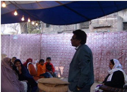
Parents Training Programme in progress

December 18 – 19, 2010: A two days Seminar for parents was held at the Mental Health Centre, Peshawar.