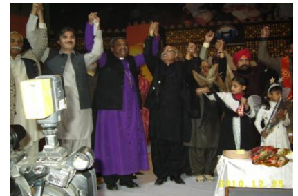
The religious leaders showing unity

youth who are our future, to our minorities & to the founder of our Nation who said, "...You may belong to any religion, caste or creed – that has nothing to do with the business of the state".