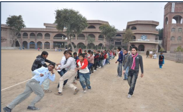
Games in progress

In January, 2012, the Diocesan Youth Desk organized 'Teen Games' in Bannu, to provide healthy social activities to youth. These 'Games' were arranged with the collaboration of 'National Sports Coalition', at the Pennell High School's ground.