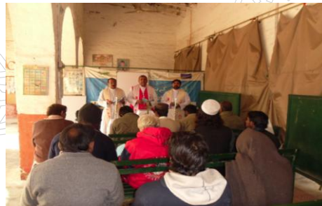
Worship in progress

The special Christmas gifts for the prisoners were a source of happiness for them. They were very thankful to the Bishop and the Diocese for remembering them and celebrating Christmas with them.