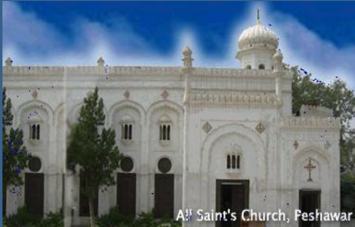
All Saint's Church, Peshawar

The All Saints' Church, Peshawar, built in 1883, a unique Church, which looks like a mosque from the outside