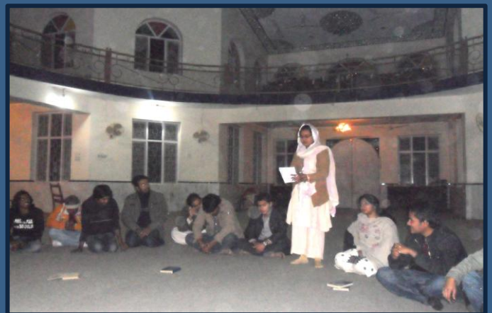
Youth Seminar in progress, at Bannu Church

At the end, the youth spent some time in prayer. The programme ended with a refreshments, and fellowship.