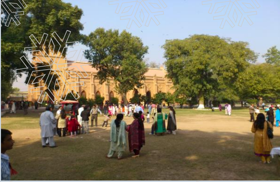
Christmas Fair at Cathedral lawns, Peshawar