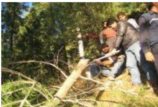
Youth getting a Christmas tree, from Abbottabad

The Bishop also appreciated the youth's efforts to bring Christmas tree all the way from Abbottabad, and for putting it on the roadside, which attracted many people, and became a great witness for Christianity in the region.