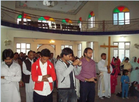
Worship in progress, at Church of the Holy Name, Bannu.