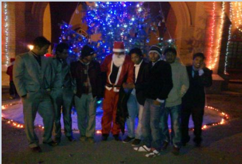
Christmas activities at St. John's Cathedral, Peshawar