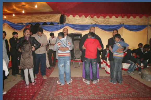
Youth presenting various Skits and Activities