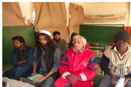
Local & foreigner prisoners attending Prayer service

It is worth mentioning that the Prison Ministry of Peshawar Diocese provides moral and legal support to the Christian prisoners in Peshawar and other jails of the Khyber Pakhtunkhwa Province.