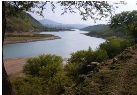
A scenic view of Khanpur

The clergy re-confirmed their commitment for the service of God, and prepared themselves for the forth coming Lent-Season.