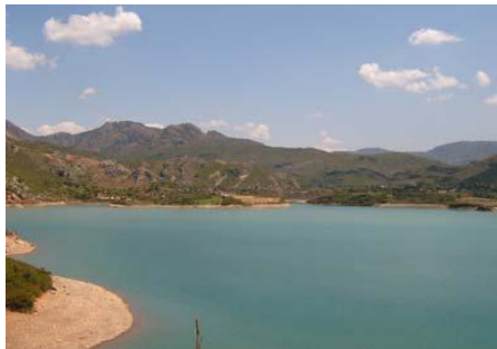
A scenic view of Khanpur