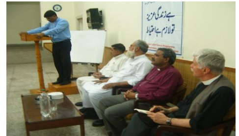
Seminar in Progress

Initiative by Jamat-e-Islami & the Diocese of Peshawar