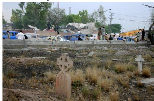
Gora Kabristan, Peshawar

Commdesk adds: The CID Police Head Office is opposite to the Diocese Graveyard (Gora Kabristan); due to powerful impact of the blast one side of the boundary wall of the graveyard was totally destroyed, and it's quite a build hundreds of yards of wall.