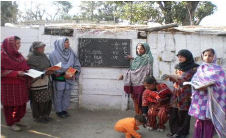
Adult Literacy Class

The Diocesan Development & Relief Sector has initiated Community Development Programmes in D. I. Khan, such as Micro-credit scheme, Adult Literacy Classes and Sewing Centers.