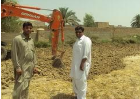
Priests of D.I. Khan, on-site