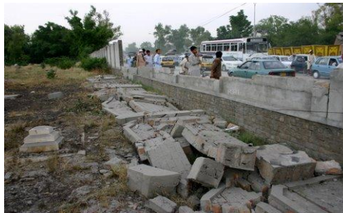
Damaged boundary wall of the graveyard

A few nearby buildings were also slightly damaged by the explosion. The windowpanes of several buildings in the vicinity were smashed due to the impact of the blast.