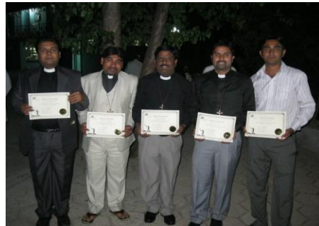
Delegation of Peshawar Diocese

The Diocese of Peshawar, apart from its own 'In-Service Training Programmes', encourages its clergy to participate in training programmes organized by other organizations as well.