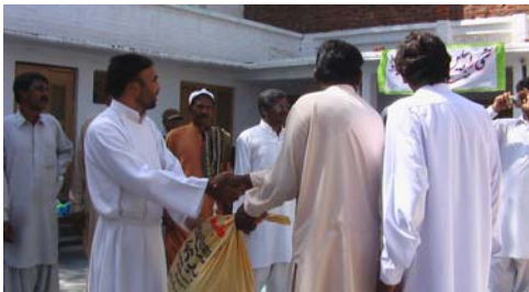
Distribution in Swat

We are thankful to God that the law and order situation of Swat and Malakand is improving and Peace prevails. Our Christian inhabitants of Swat and Malakand are now also settled. Due to the destruction caused by militants and the military operation they have lost their belongings, but since the infrastructure is developing they are also getting compensated.