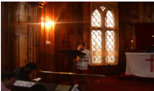
The Interior, Nathiagali Church

This historical church was built in 1914 by the British, infact all the hill stations were developed during the British Raj.