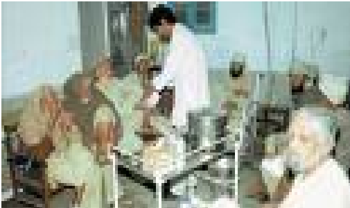
Out Patient Department (OPD)

The Mission Hospital, Peshawar is an activity of the Peshawar Diocese. It is one of the oldest hospitals of the N.W.F.P, established in 1901 by the British missionaries. In old times, people not only used to come from the far flung areas of the N.W.F.P but also from Afghanistan. The hospital's old name was 'Afghan Mission Hospital'.