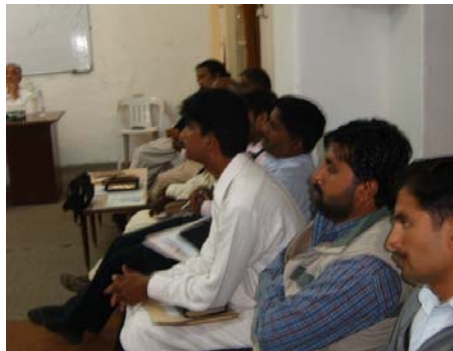
Clergy Teaching Session