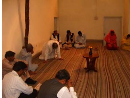
Junior Clergy, Prayer Session

Oct, 29, 2009: The fifth and the last Junior Clergy Study Day of this year was held at the Diocesan Centre, Peshawar. About 25 clergymen participated and learnt a lot. The topic of this study day was " Liturgy ".