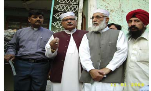
Faith Friends Members along with Information Minister, NWFP

Nov, 1, 2009: Members and office bearers of the Faith Friends went to see the site of the bomb blast at Pipal Mandi and Meena Bazar, where hundreds got injured and 119 got killed as a result of a remotely controlled/detonated bomb blast. This is a thickly populated area with shops and houses. Most of the buildings are double or tripple storey, and old as well.