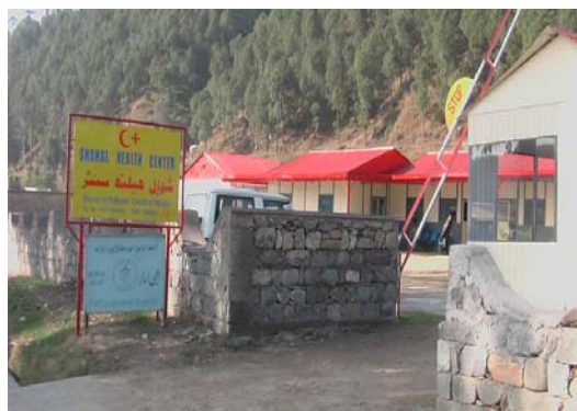
Shawal Health Clinic, Balakot

The Peshawar Diocese, along with the help of its 'Friends and Partners' responded quickly to help the people in need. It adopted six villages of Pateka and Shawal, Balakot. The main objective was/is to rehabilitate the people and to develop the area.