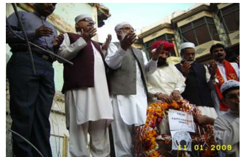
Faith Friends praying for the deceased and the injured

The Faith Friends members and office bearers also paid a visit to the sight to show solidarity with the blast victims and their families, the Provincial Information minister, Mian Iftakhar and other dignitaries were also present on the occasion.