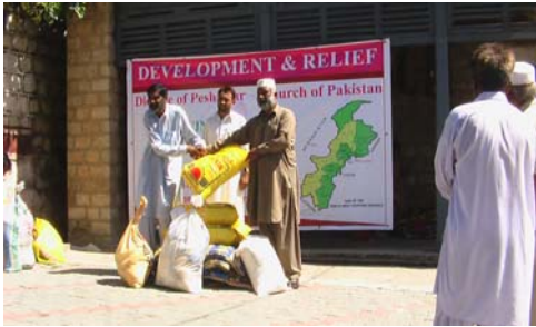
Distribution of Relief Package in Malakand

We are thankful to God that the law and order situation of Swat and Malakand is improving and Peace prevails. Our Christian inhabitants of Swat and Malakand are now also settled. Due to the destruction caused by militants and the military operation they have lost their belongings, but since the infrastructure is developing they are also getting compensated.