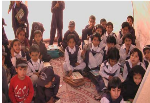
A Class in session, New Light Public School

October 8, 2009: The fourth anniversary of the Earthquake, 2005 was marked all over Pakistan. One minute silence was observed throughout the country to commemorate the saddest day of the Pakistan's history when more than 70 thousand people lost their lives and became homeless.