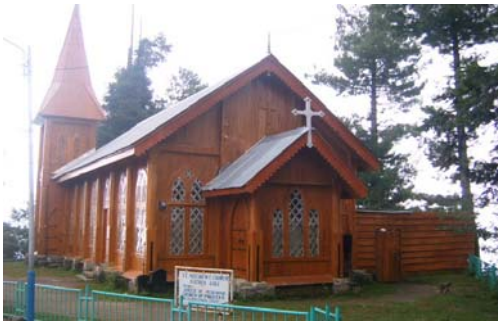
The Nathiagali Church

N.W.F.P is blessed with nature's beauty, and Nathiagali is one of the most beautiful places in Pakistan, a hill station near Murree where people go to escape the heat of the plains in Summer.