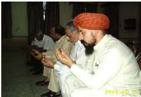
Faith Friends Members