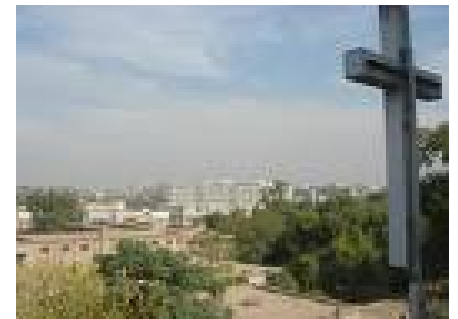
A view of Hospital from the top of the Chapel

v) Mental Health Centre: MHC was given three rooms by the Hospital to run its Physiotherapy Clinic at its premises.