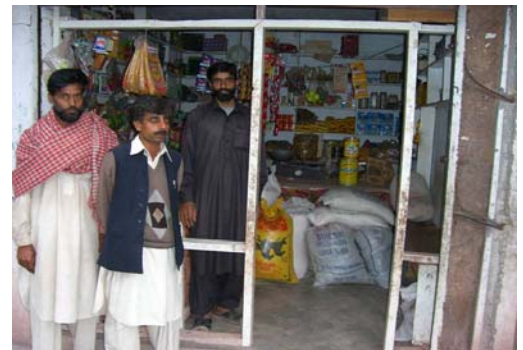
Community Business through Micro-credit Scheme

An English Medium School (High School) named New Light Public School, Pateka, has also been established which is producing good results and flourishing day by day.