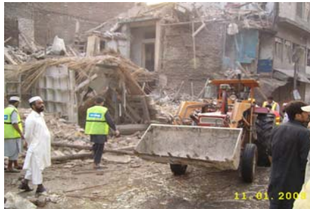
Destruction after the Bomb Blast

Oct, 28, 2009: The extremist hit Peshawar once again, this time it was the most busy market area, the thickly populated Pipal Mandi and Meena Bazar. An explosive laden vehicle was detonated by a remote control device during rush hours.