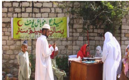
Risalpur Clinic Staff during Medical Camp

Free Medical Camps were organized in Swat and Malakand with the help and cooperation of the Diocesan Health Clinic, Risalpur. Free treatment and medicines were given without any religious discrimination. This is a facility much needed after the recent operation in Swat and Malakand.