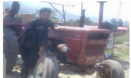
Agricultural Development Programme

The main source of income of the locals is through agriculture, they were provided with latest equipment, i.e. Tractor, trolleys, thresher, etc., to plough and grow their own food, the Diocese also provided them livestock: cows, goats etc. The people of the land have taken full advantage of this help and are now self-sufficient, as far as their food is concerned. The livestock has enabled the local community to sell milk and butter after fulfilling their own need.