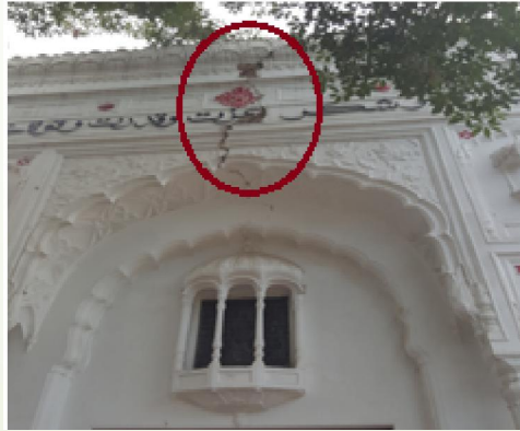
All Saints' Church, Peshawar, City

“and there will be great earthquakes, and in various places plagues and famines; and there will be terrors and great signs from heaven”: Luke 21:11