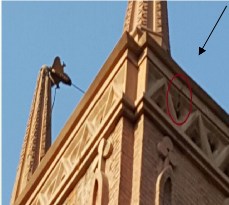
St. John's Cathedral, Peshawar Cantt.