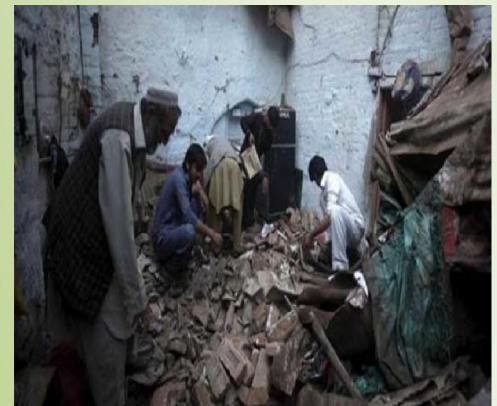
Earthquake destruction in Images