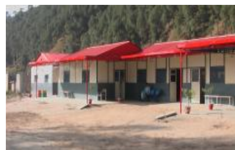
Shahwal Health Care Centre in 2008

The Diocesan Health Centre at Shahwal was started in response to the October 8, 2005 earthquake in tents. On the request of the people of Balakot the Diocese continues its health care service in the earthquake affected area. The earthquake resistant building is the Diocesan commitment, and to provide health care services to the under privileged and vulnerable people of God.