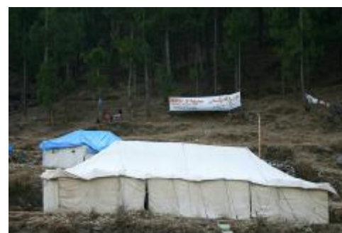
Shahwal Health Care Centre in October 2005