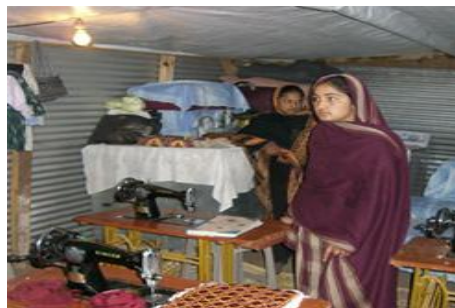
A sewing center in the village of Pateka, Pakistan.

Servanthood ministry: The catastrophic earthquake of October 8, 2005 in Pakistan killed an estimated 86,000 people. The diocese responded to the emergency by adopting a cluster of six villages in an area known as Pateka. Besides the immediate response to provide food, clothing, shelter and medical aid right after the earthquake, the diocese is now involved in the rehabilitation and reconstruction of these villages. It facilitated the creation of a community-based organization (CBO) to address the various needs of the communities for livelihood recovery, health, education, water and sanitation, house repair and other communal needs.